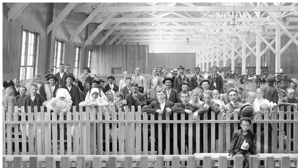
Locust Point has been called "Baltimore's Ellis Island", having been the 3rd largest point of entry for immigrants to the U.S after New York and Philadelphia.

MORA has helped more than 40,000 refugees make Maryland their home, aiding their transition from "displaced persons" to independent, contributing members of the national economy and the local communities. We work through a network of public and private service providers, to plan, administer, and coordinate transitional services aimed at helping refugees become self-sufficient as quickly as possible. Key areas for aiding refugees in adjusting to American life include financial assistance, job placement, community orientation, English language and vocational training, academic support for youth, case management, and other support services.