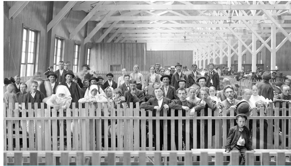
Locust Point has been called "Baltimore's Ellis Island", having been the 3rd largest point of entry for immigrants to the U.S after New York and Philadelphia.

MORA has helped more than 40,000 refugees make Maryland their home, aiding their transition from "displaced persons" to independent, contributing members of the national economy and the local communities. We work through a network of public and private service providers, to plan, administer, and coordinate transitional services aimed at helping refugees become self-sufficient as quickly as possible. Key areas for aiding refugees in adjusting to American life include financial assistance, job placement, community orientation, English language and vocational training, academic support for youth, case management, and other support services.