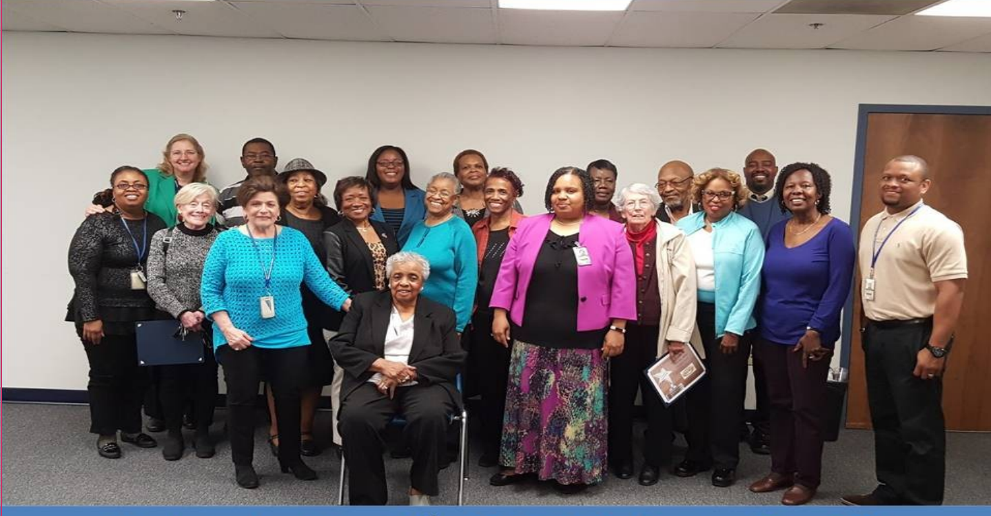
Wednesday, May 18th, 2016 @ Baltimore City DSS

Baltimore City Volunteer Appreciation Lunch & Board Meeting