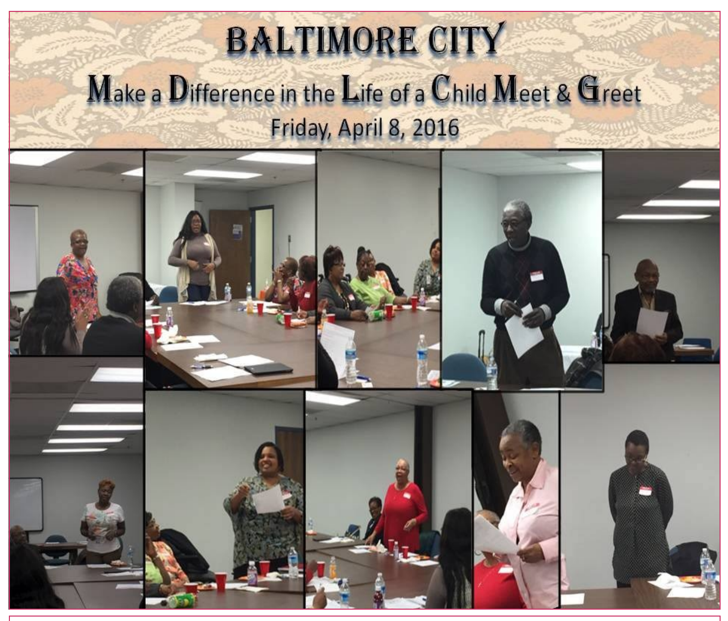
Make a Difference in the Life of a Child Meet & Greet

On Friday, April 8, 2016 Citizens Review Board for Children hosted a Meet & Greet at the Baltimore City Department of Social Services. Baltimore City members, CRBC staff and potential volunteer members participated. Current members invited potential volunteers and they had an opportunity to learn more about CRBC and the work that CRBC does. Several current volunteers discussed their volunteer experience, a mock review was presented by CRBC staff and current volunteers, and there was an information table.