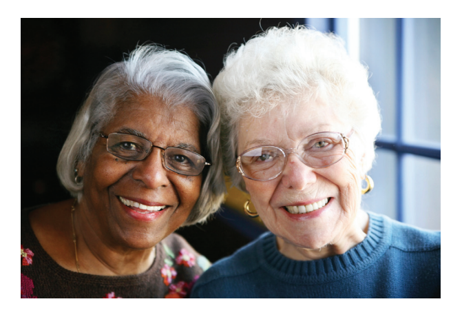
flag. These are often tell-tale signs that an elderly or disabled person resides in that home, with or without a spouse or a dependent caregiver.

For these reasons, we implore Adult Services staff to be vigilant advocates for our vulnerable elderly and disabled clients when conducting investigations, providing personal care and chore services, and completing a six-month reconsideration visit. A client may express to the worker that they have concerns about repairs being done, may lack the financial resources to pay for such repairs, or possibly mention that a man stopped by the house to drop-off a flyer and talk with them about doing the repair work for a very low cost. If this information is shared, workers should be suspicious! According to the Maryland Attorney General's Consumer Protection Division, individuals should be dealing with a licensed contractor that is recommended to them from a trusted friend, neighbor, or reputable agency. It is important to share this information with our client and the client's spouse or caregiver that they should first check out the contractor's professional credentials before considering any such work to be performed on their homes.